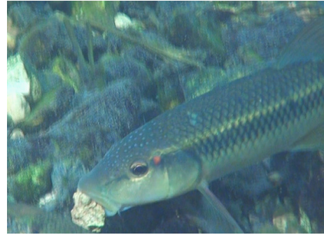
The redspot chub uses its mouth to build rocky mounds

shiners and green-eyed banded sculpins. A video of redspot chubs showed them using their mouths to build foot-high pyramids near their nests.